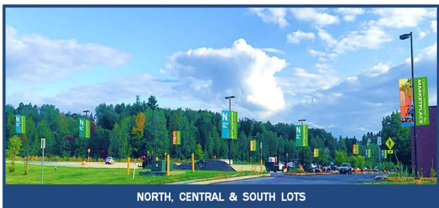
NORTH, CENTRAL & SOUTH LOTS