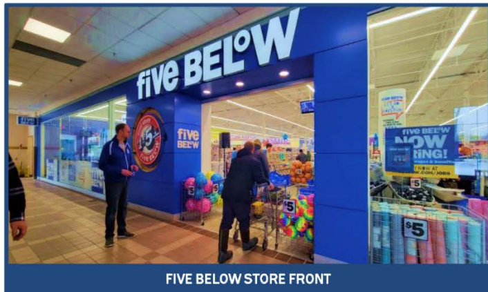
FIVE BELOW STORE FRONT

Now, the New Jersey-based developer is proud to add two new top-tier retailers to the property, totaling almost 60,000 square feet and further creating a dynamic center where Central Vermont residents can shop, work and live. In February 2023, variety store Five Below opened its doors at the Central Vermont Marketplace. Berlin is Five Below's first