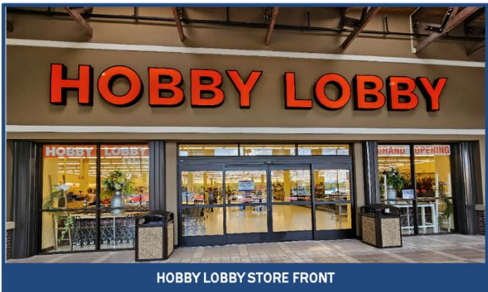
HOBBY LOBBY STORE FRONT