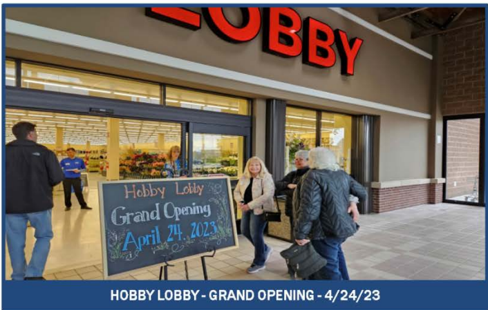
HOBBY LOBBY - GRAND OPENING - 4/24/23

location in the state of Vermont. In late April, Five Below was joined by Hobby Lobby, which not only took over the former JC Penney 34,000 square foot anchor, but also expanded into nearly 16,000 square feet of consecutive inline tenant spaces.