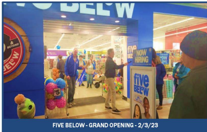
FIVE BELOW - GRAND OPENING - 2/3/23